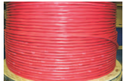
POWER AC IN-WALL CABLE

We are the only company in the world who manufactures specialized AC wiring made specifically to allow your A/V system to perform better than all the rest. By providing clean AC power to your system with dedicated high-quality runs straight from the breaker panel, present and future noise problems are a thing of the past.. Be sure to specify JPS Labs cables for the finest results from your system investment.