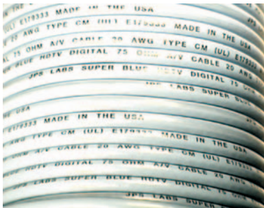
SUPER BLUE 75 OHM DIGITAL/VIDEO CABLE

Super Blue's high purity metal content and oil/water resistant jacket insure long-term quality and enjoyment in any home environment.