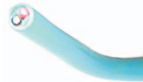
SUPER BLUE SPEAKER CABLE 2 and 4 conductor versions available

Super Blue's high purity metal content and oil/water resistant jacket insure long-term quality and enjoyment in any home environment.